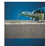
Acid resistant/chemical resistant