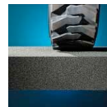
High compressive strength