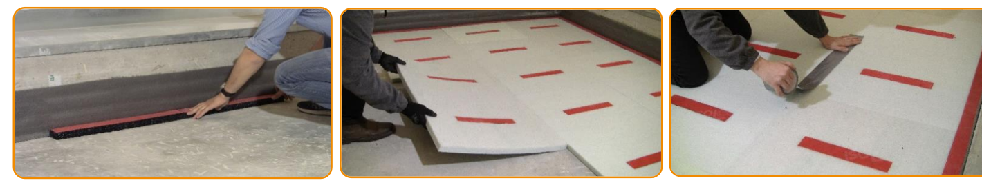
Install the adhesive strip Profyle Flat to the wall and the Side Highmat along the whole perimeter.