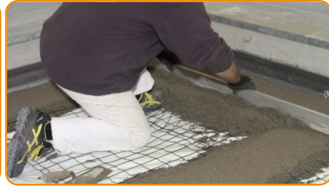
Install the reinforcement mesh (Ø 5 mm, net Apply the finishing on top of the screed and 200 mm) and build the screed (th. > 60 mm).