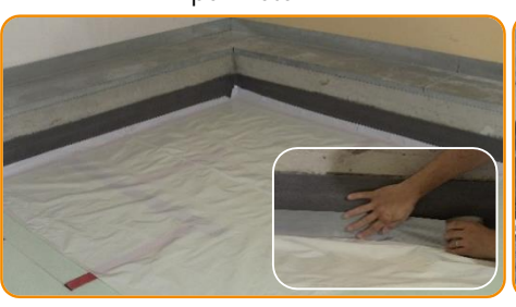
Apply a waterproof foil on the whole surface to protect the resilient layer.