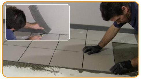
cut the exceeding edging strip only at the