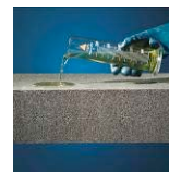
Acid resistant/chemical resistant