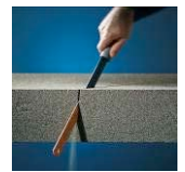
Easy cut to shape