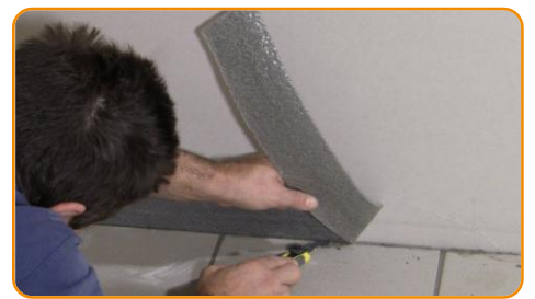
Lay down the final floor covering (ceramic or When the flooring application is completed, cut the exceeding part of the edging strips.