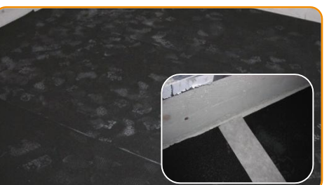
Lay down the insulation layer. Seal the roll border by using the adhesive stik tape.