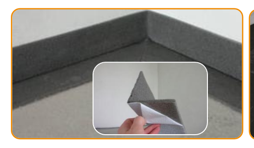
Insulate the concave corners with the "Profile" strip by cutting it as shown in the drawing.