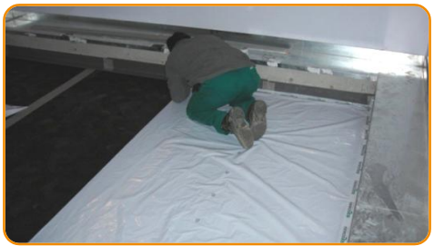
Apply polyethylene layer with as protection