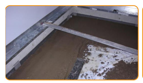
Melt the screed