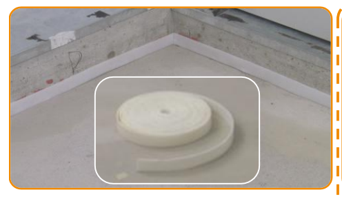
Apply the Profyle Flat 5 all along the room perimeter.