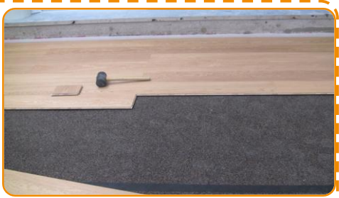
DRY APPLICATION: lay down the Sylwood and seal the roll jointing borders with the adhesive stik tape; then apply the parquet boards.