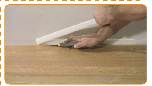
When the flooring application is completed, cut the exceeding part of the ISOIGOMMA